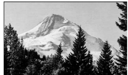
Izaak Walton League of America Endowment, Inc. www.iwlaendowment.org